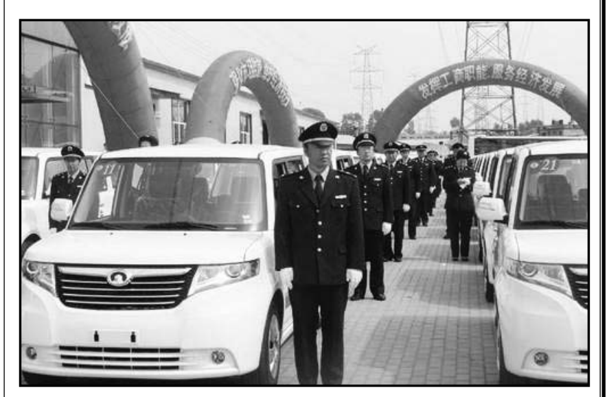
Great Wall Motors shows off its fleet (police escort not included with vehicle)

The bottom line is that the Chinese, culturally, don't share the West's concepts on either human rights or intellectual property. The Chinese see