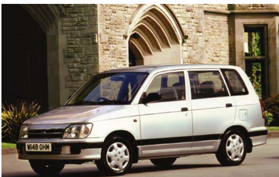
The Daihatsu Gran Move

However, Daihatsu was too small to survive by itself, and began a partnership with Toyota in 1967.