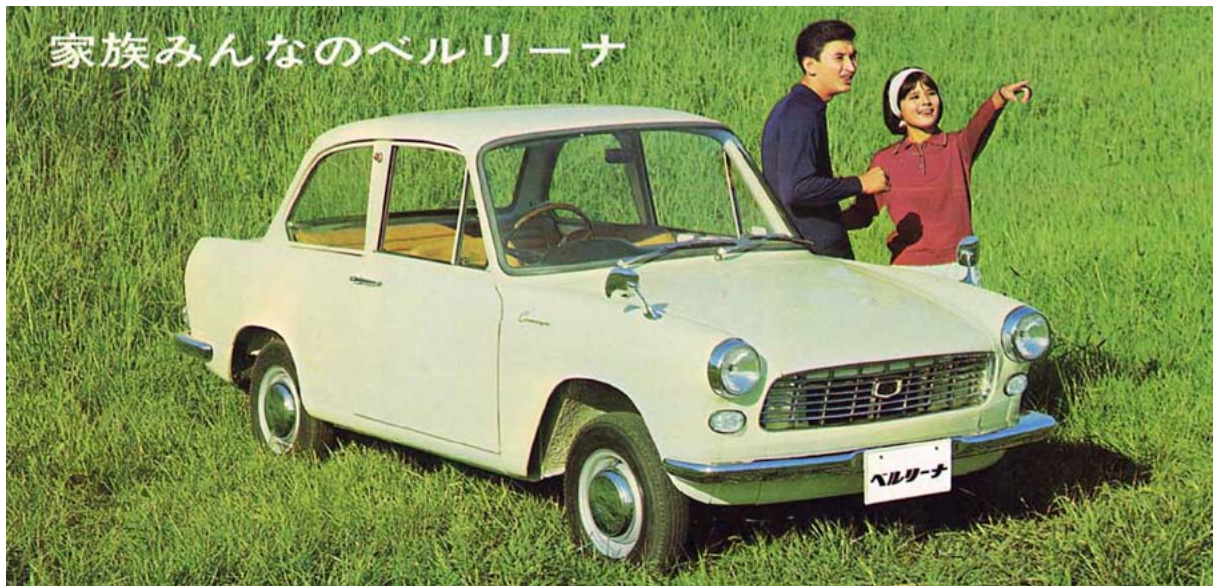
The Daihatsu Compagno

F OUNDED IN 1907 as the Hatsudoki Seizo Co Ltd , Daihatsu originally produced engines only, and did not start making motor vehicles until 1930.