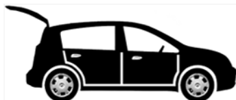
Five-door hatchback / liftback

Although coupés generally have rear seats, they often (but not always) have only two doors. A coupé may be similar to a sports car; the major differences are that a coupé has a fixed roof (as opposed to a removable roof) and is often a sporty, somewhat upmarket variation of an existing mainstream car. The correct pronunciation is coo-pay , not coop , which is where you keep chickens.