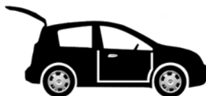
Three-door hatchback / liftback

A hatchback / liftback is a passenger car with two or four side doors and a hinged door (which includes the rear window) covering most of the back of the vehicle. This door lifts upwards to give easy access to the rear luggage storage area. The terms liftback and hatchback mean roughly the same thing.