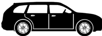
Station wagon / estate

Five-door hatchbacks are very practical for small families because they can generally carry up to five passengers, and when there's no one in the back, the rear seats usually fold flat for increased luggage storage.