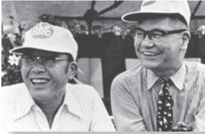
Honda president Soichiro Honda & his vice-president show their deep distress at the fall of the American car industry.

In 1982, Honda was the first Japanese car manufacturer to build a car plant in the US. This made it more difficult for American carmakers to brand Honda as a foreign invader.