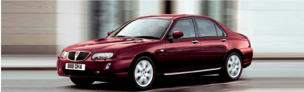
The ill-fated Rover 75, Rover’s last model

With BMW in charge, Rover lost its new masters a cool $US6billion.