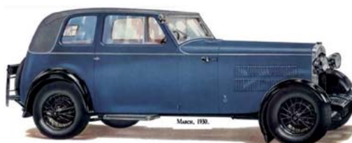
ROVER LIGHT SIX SPORTSMAN'S SALOON

The Rover company began producing cars in 1904, which, as might be expected, had cycle-like frames. However, The Rover company went from strength to strength, and by 1912 Rover was a major English manufacturer. There's more money to be made building expensive cars than building cheap ones, so after World War I, Rover began manufacturing quality vehicles for the conservative middle classes of Great Britain and her colonies.