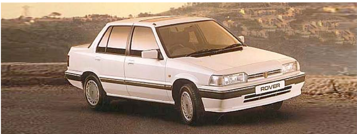
The 1984 Rover 213, otherwise known as the Honda Civic