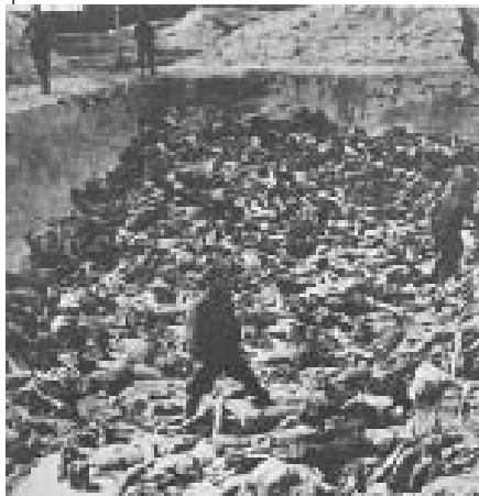
Hitler's novel solution to Germany's lack of living space

As they said in the 1950s: 'What's good for General Motors is good for America'. Yeah, right •