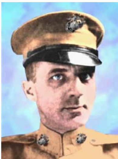
Smedley Darlington Butler

Along with friends of the Morgan Bank and General Motors, certain Du Pont backers financed a coup d’etat that would overthrow the President with the aid of a $3 million-funded army of terrorists, modelled on the fascist movement in Paris. Roosevelt would be deposed and an all-white corporate team, under Butler, would rule America