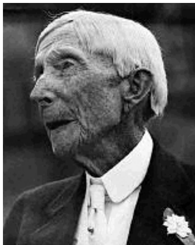
John D. Rockefeller

Rockefeller's basic technique was to move into a new area and flood the local market with cheap oil until his competitors went broke, then he would quickly raise the price to the highest that the market would stand